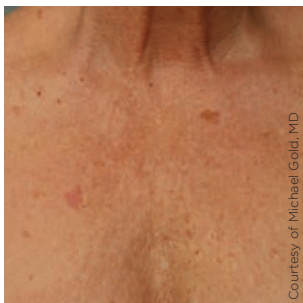
After 180 Days