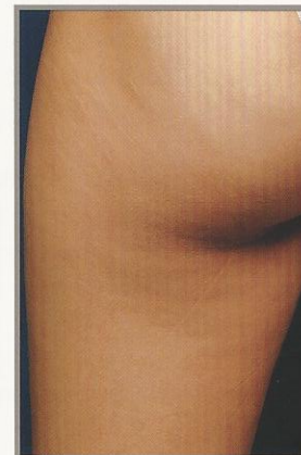
6 MONTHS POST TREATMENT