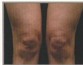
2 MONTHS POST TREATMENT