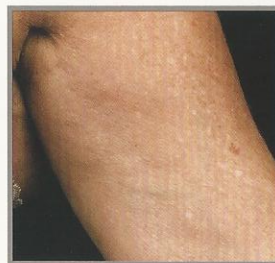
2 MONTHS POST TREATMENT