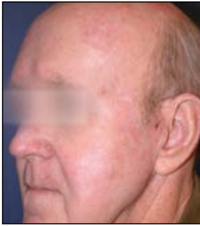
AFTER, 3 weeks post 2 treatments