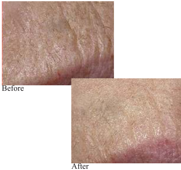
Upper lip area after 5 treatments.